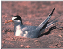
Interior Least Tern